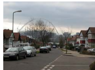
View out of the Area from Barn Hill

The relationship between the layout of the roads and the positioning of the houses cascading down the hillside sets this Conservation Area apart from other residential areas. The changes in level make Barn Hill unusual in Brent in that there are views over between and around the houses to distant locations, such as the Stadium and Harrow on the Hill. The mature landscape setting is particularly attractive and the dips in the roads, the inclines, the views between well spaced houses and glimpse over Wembley and across, to Harrow is unique. Maintaining the gaps between houses has been a long-established key policy for the area in facilitating views and preserving the open setting of buildings.