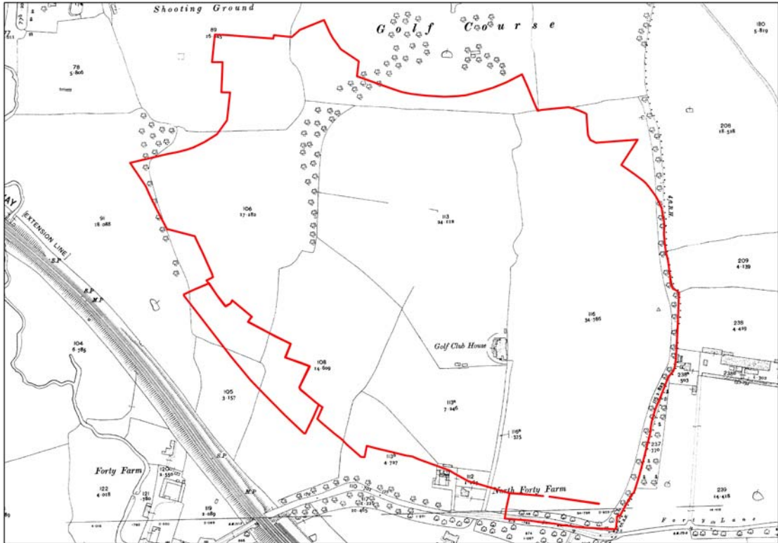
Barn Hill c.1910